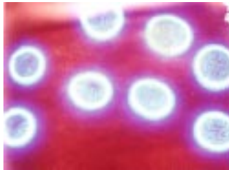
Figure 2. Two exposures (kexp2)