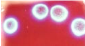
Figure 1. One exposure (kexp1)